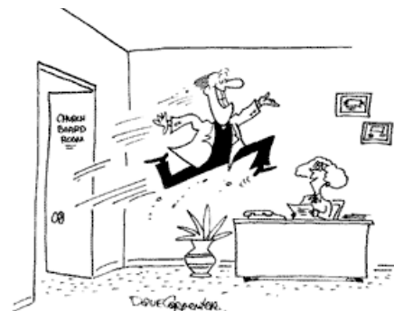
"I take it the Board 'okayed' your new project."